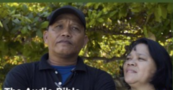
The Audio Bible is one of the big impacts for me.